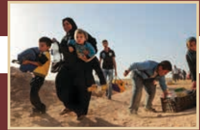
Syrian Refugees crossing the border to Jordan to escape war.